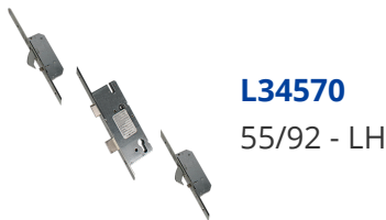
L34570 55/92 - LH