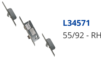
L34571 55/92 - RH