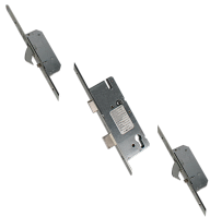
L34570 55/92 - LH