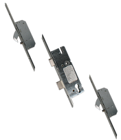
L24356 45/92 - LH