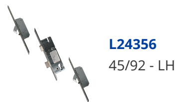
L24356 45/92 - LH