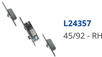
L24357 45/92 - RH