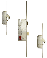
L23533 55 BS RH