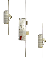
L23531 45 BS RH