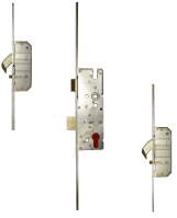
L23532 45 BS LH