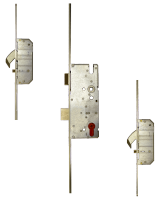
L23534 55 BS LH