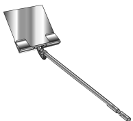
L19839 Without Foam Wedge