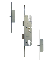
L15603 35/92- 16mm Faceplate