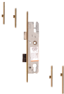
L11763 30/92 - 16mm Faceplate