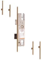
L11763 30/92 - 16mm Faceplate