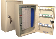
L8165 GREY 30 Key