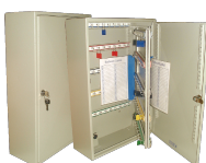
L8170 GREY 150 Key