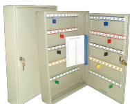
L8169 GREY 100 Key