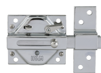
L23657 CS88M NP