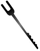
L16168 Rake RP9