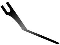
L16161 Straight RP3