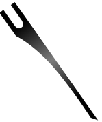
L16162 Straight RP2