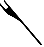
10041 Straight P2