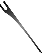
L16173 Straight RP14