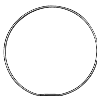
7178 152mm LKR6