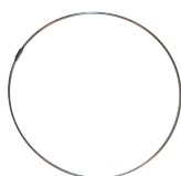
7179 204mm LKR8