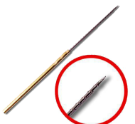
L621 Spiral EZ5