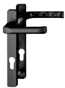
L27303 92mm Centres Black