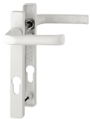
L13080 92mm Centres White