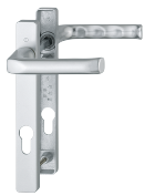
L13078 92mm Centres Silver