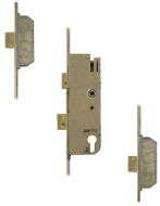
L23587 45mm Backset