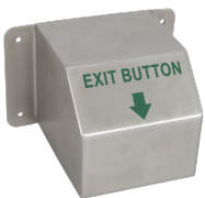
L35034 Stainless Steel