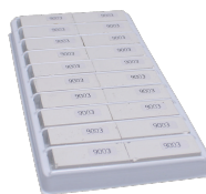
L34970 White (20 Pack)