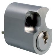
L33391 NP A90D