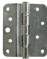
L25254 Polished Chrome