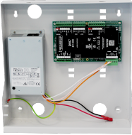
L34057 In Metal Cabinet