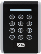
L34061 Black & Grey