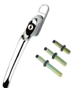
L33620 Polished Chrome