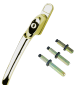
L33621 Polished Gold