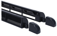
L33535 Anthracite Grey