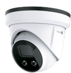
L32803 White 010-705