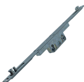
L32819 500mm Bar Length