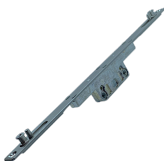
L32817 280mm Bar Length