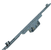
L32820 630mm Bar Length