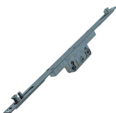
L32818 370mm Bar Length