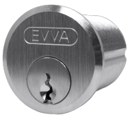
L22185 Single NP