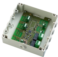
L25623 Plastic Enclosure