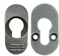
L18053 Sentinel Security Escutcheon