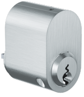
L17561 NP EP82