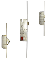
L32786 45mm Backset No Deadbolt RH