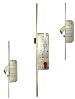
L32785 45mm Backset No Deadbolt LH