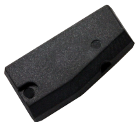
L32667 4C (CARBON)