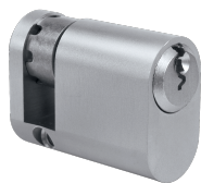
L10216 41mm (32/9) MK `AMK1` NP