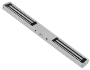
AS12259 12/24VDC Unmonitored