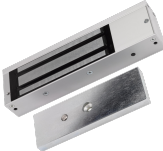
AS12264 12/24VDC Unmonitored