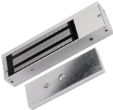
AS12265 12/24VDC Monitored