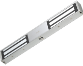
AS12266 12/24VDC Unmonitored