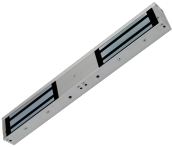
AS12267 12/24VDC Monitored