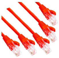
L32447 5m Red