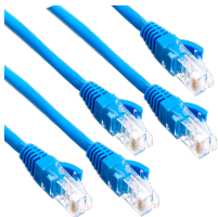
L32440 0.5m Blue