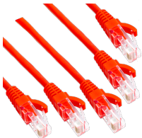
L32439 0.5m Red