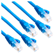
L32446 3m Blue