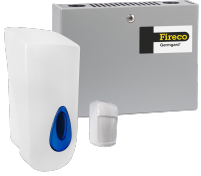
L31773 Without Monitor