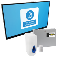
L31772 With Monitor