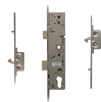
L15438 35/92 - Option 2