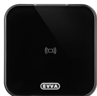
L31687 Surface Black