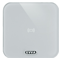
L31688 Surface Silver