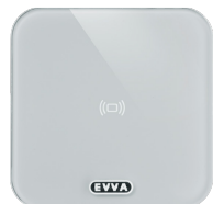
L31686 Flush Silver