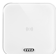
L31689 Surface White