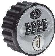
L31305 Black Trim Silver Face