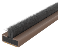
L31218 10mm x 4mm - Brown