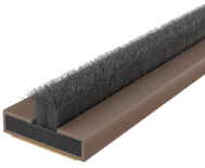
L31222 15mm x 4mm - Brown