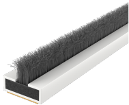
L31217 10mm x 4mm - White