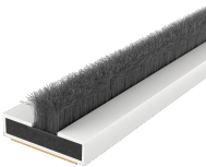
L31221 15mm x 4mm - White