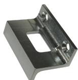
L31133 Zinc Plated