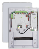
L31034 White 010-751