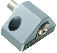
705 Grey Visi