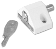
L307 White Visi