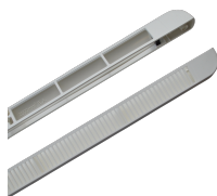
L30322 2500F White