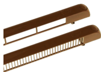
L30317 1250F Brown