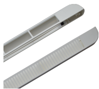
L30318 1250F White