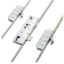
L30299 45/92 LH