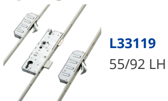
L33119 55/92 LH