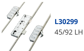
L30299 45/92 LH