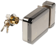
L30084 MVA - Without Manual Override