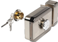
L30085 MVM - With Manual Override