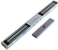
L30069 FR-A10005 Monitored