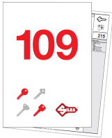
7089 109 Key Catalogue