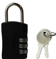
AS11476 3 Wheel