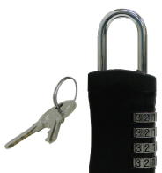
AS11477 4 Wheel