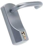
L29702 With Cylinder