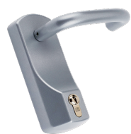
L29702 With Cylinder