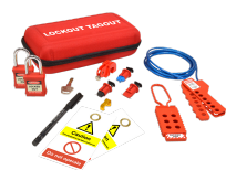
AS11508 Maintenance Electrical Lockout Kit