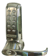
L15763 CL4010L Lever Operated